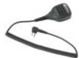
Remote Speaker Microphone with improved noise cancellation capabilities (IP57) - MDPMMN4029