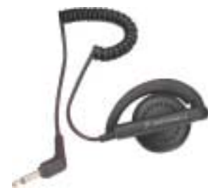
Over Ear Piece for RSM- WADN4190