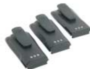
High Capacity Li-Ion Battery, Slim Li-Ion Battery and NiMH Battery - NNTN4497, NNTN4970 and NNTN4851