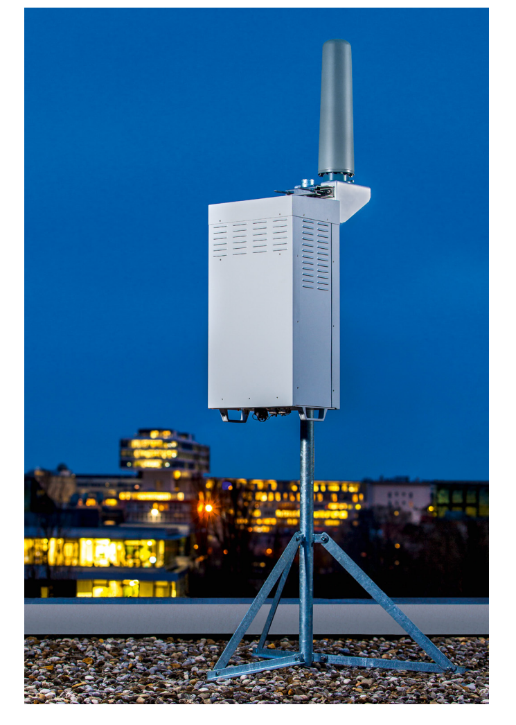
R&S®UMS300: ITU-compliant monitoring and direction finding with TDOA capability